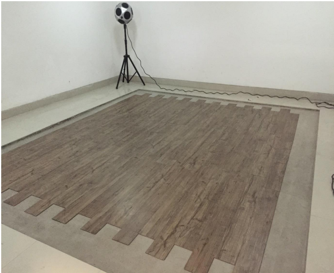
Test set up