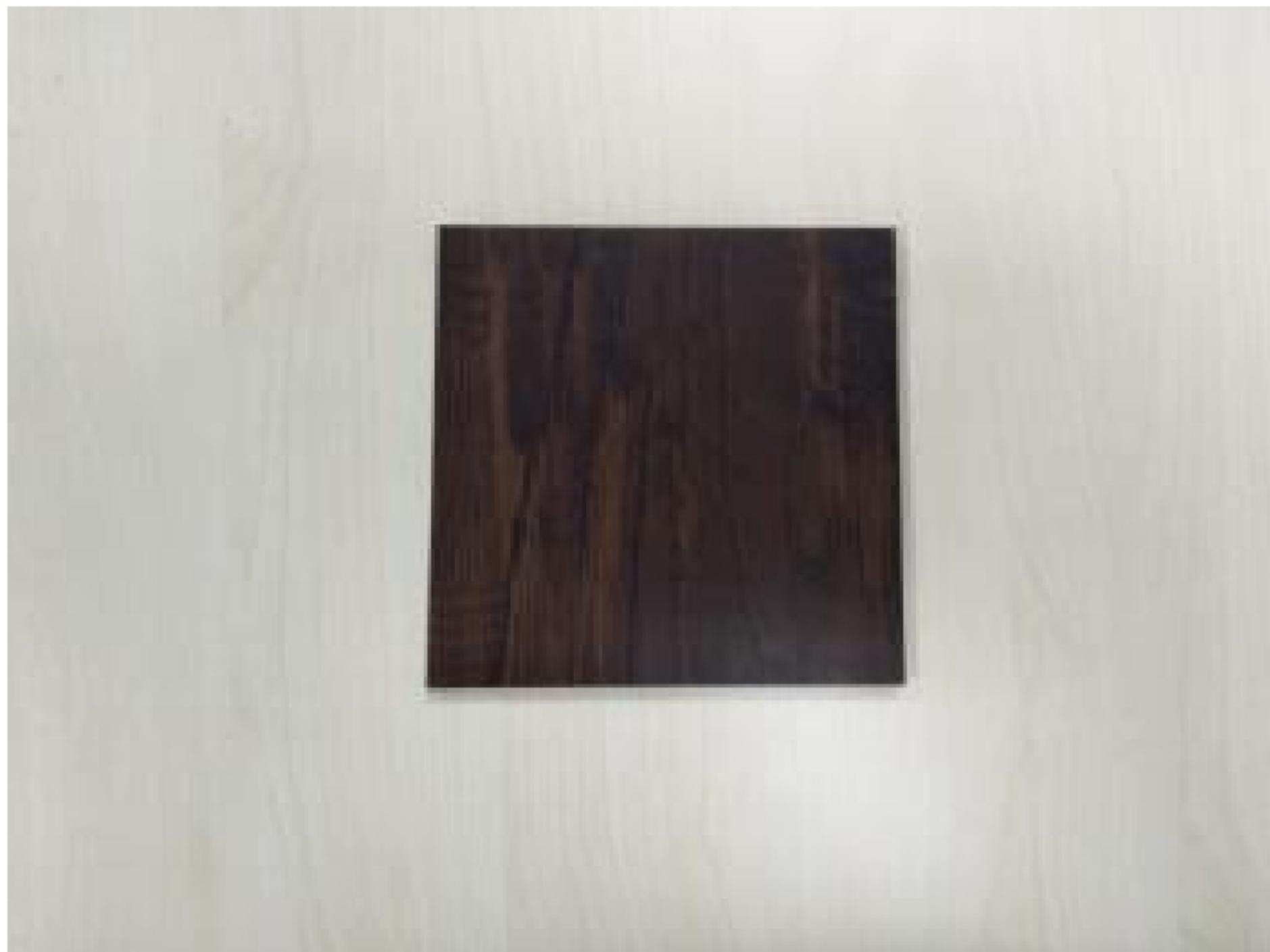
Front view(Test face)