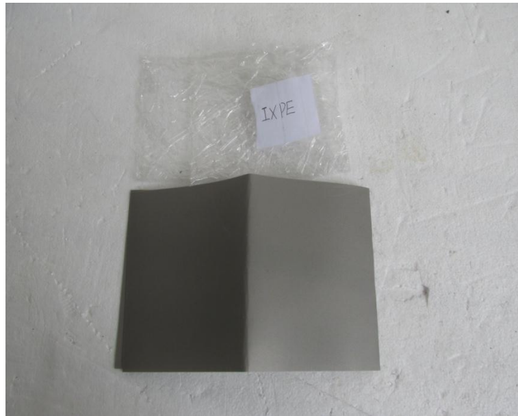
Fig1. Sample as received