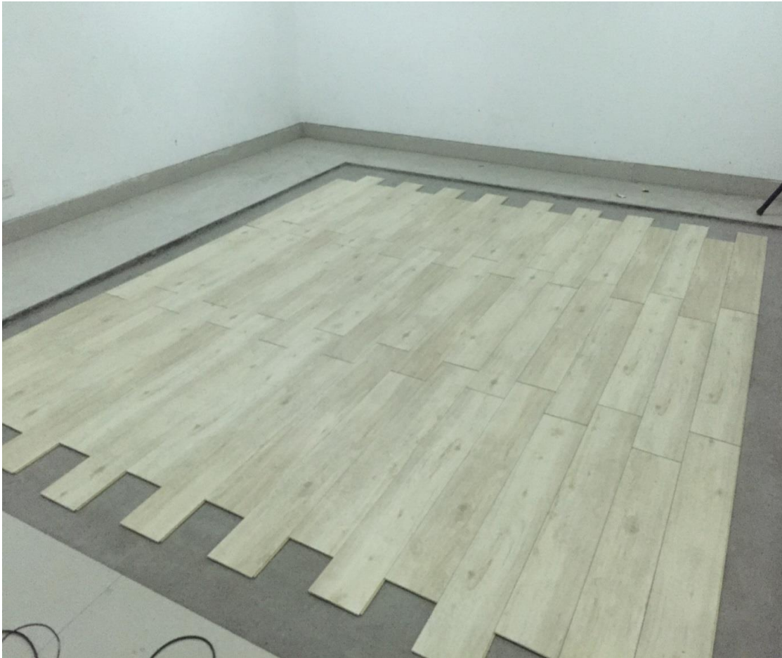
Test set up