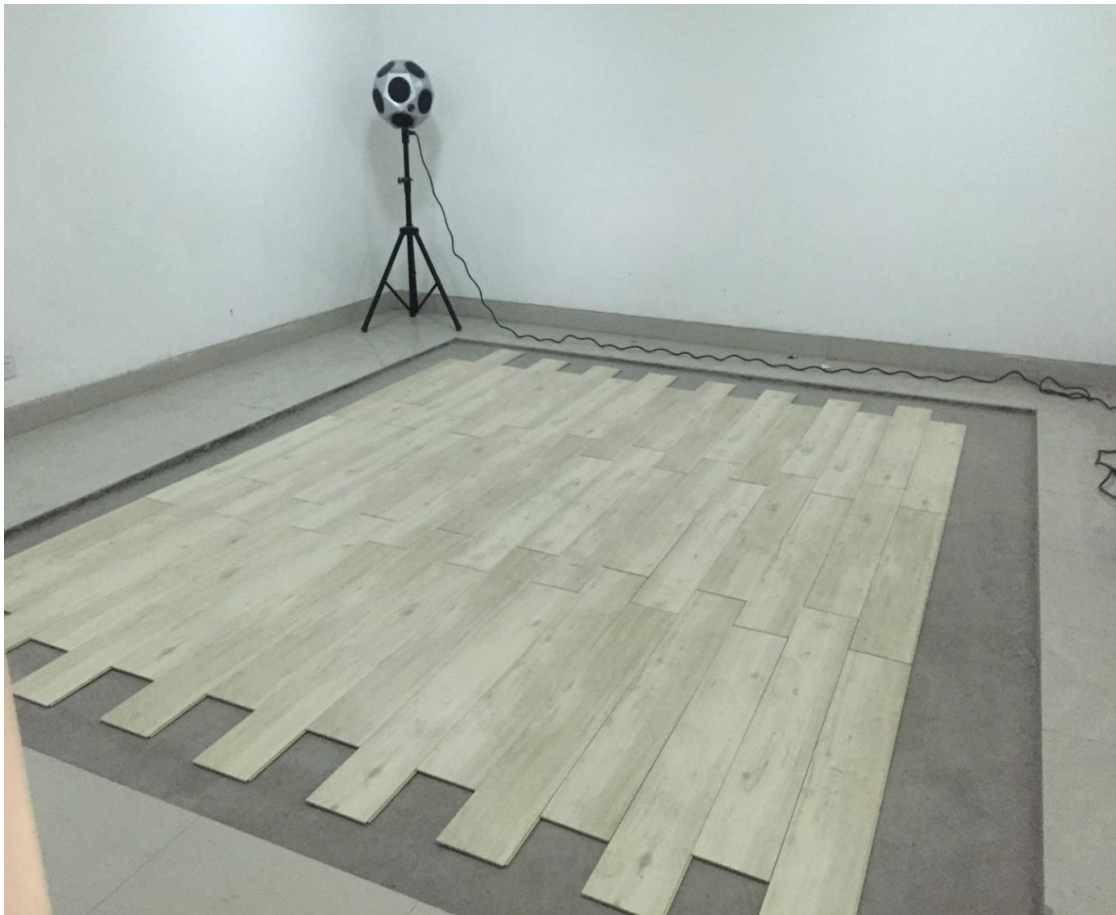
Test set up